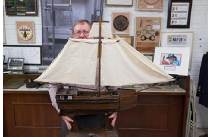
Battlecruiser Brandywine 1915